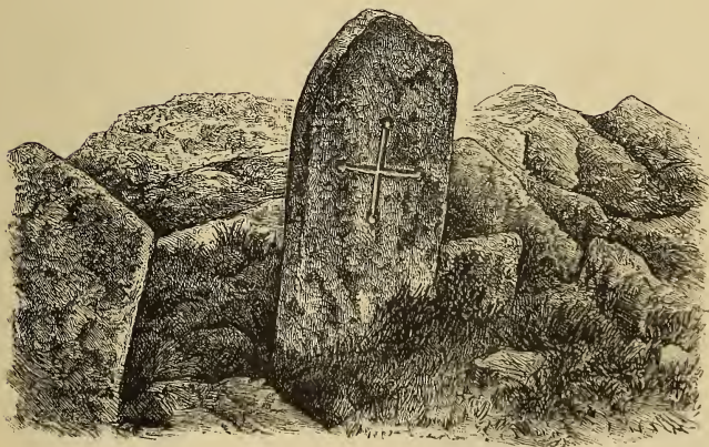
IN THE BURYING-GROUND, EILEAN NA NAOIMH.

KEEPER OF THE NATIONAL MUSEUM OF THE ANTIQUARIES OF SCOTLAND